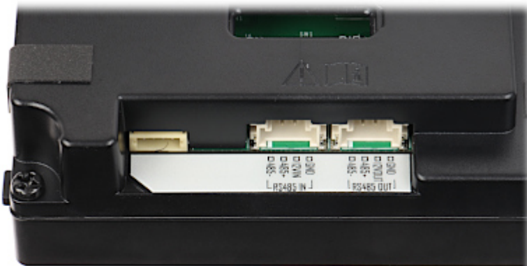
Example of application: