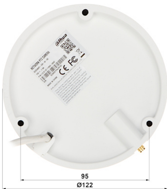
Camera mounting dimensions: