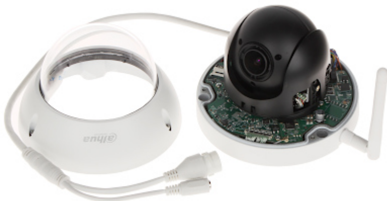
Memory card slot: