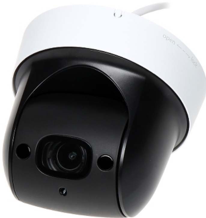
Memory card slot: