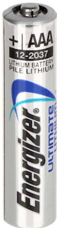
Comparison of Lithium and Alkaline batteries capacity: