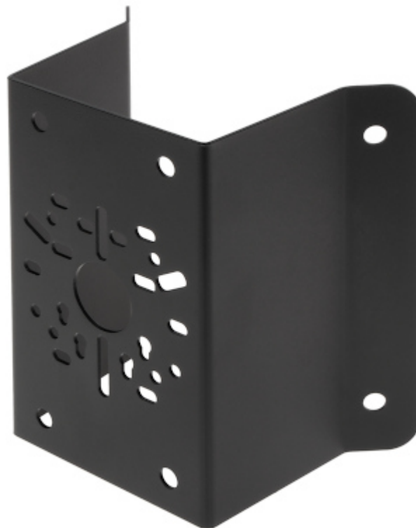
Camera bracket, which enables camera installation on the building corner.

The device must be secured against contact with caustic, staining and viscous fluids.