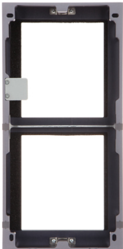
View after removing the front panel: