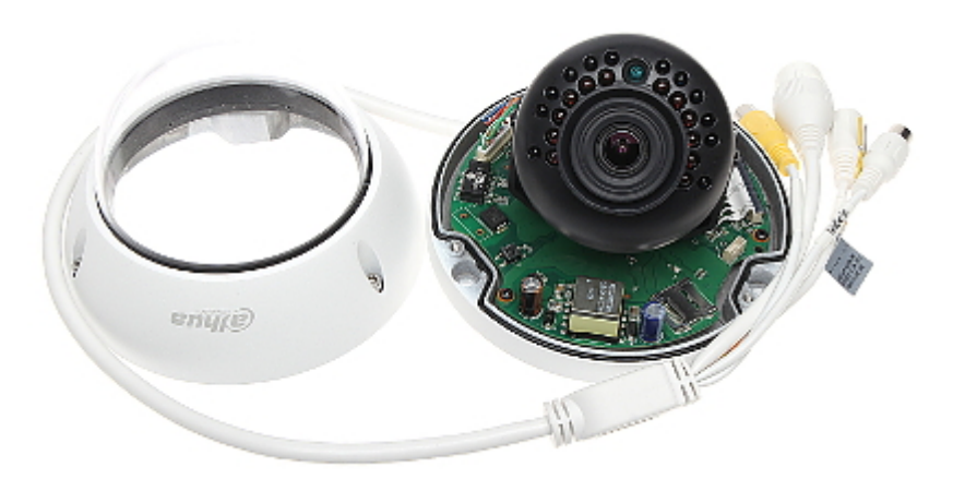
Micro SD card slot is located inside the camera:

Camera view after remove the Dome cover: