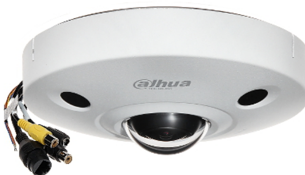
IP camera with "fish eye" wide-angle lens.

To return a worn-out product, use a collection and disposal system of this type of equipment or contact a seller from whom it was purchased. He will then be recycled in an environmentally-friendly way.