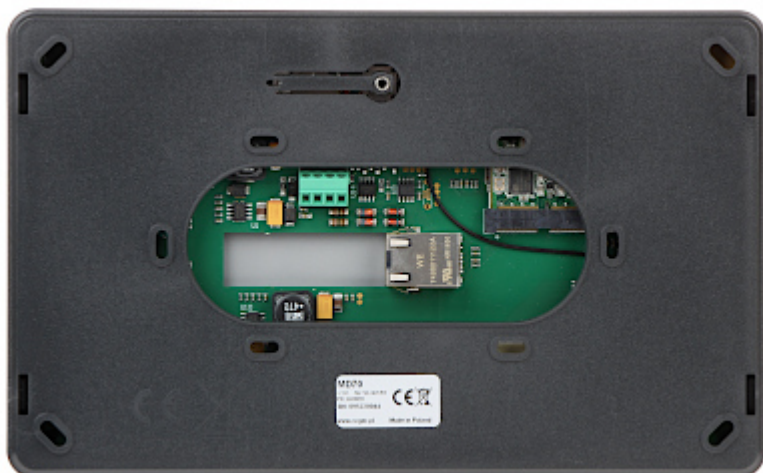
Internal view (after open the enclosure):