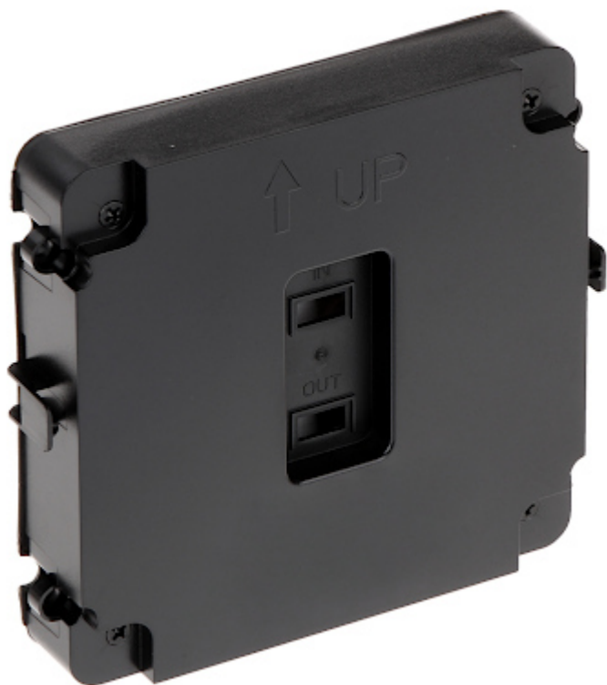
Internal view of the housing: