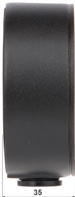
Wall mounting side view: