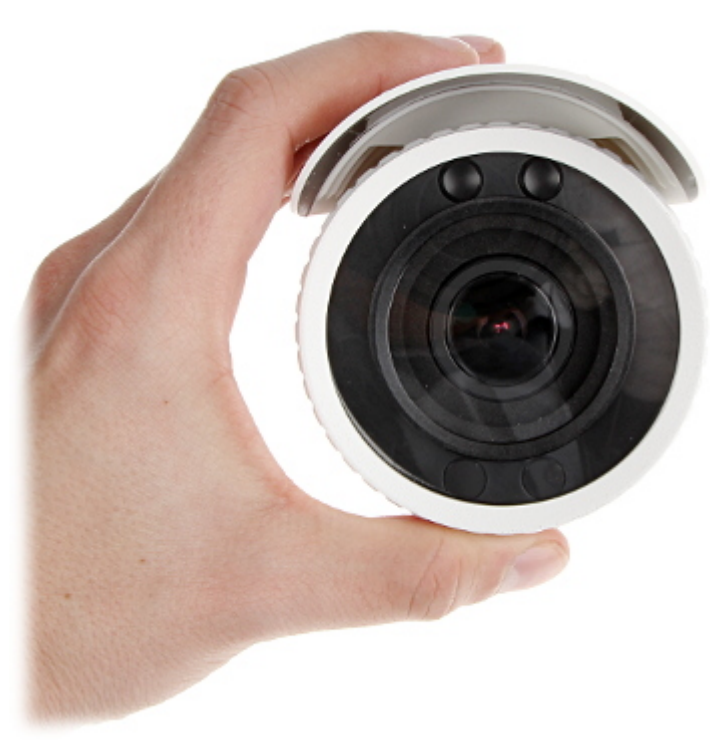
View after remove the cover: