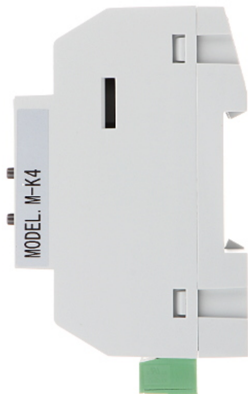
Rear panel (DIN rail installation):