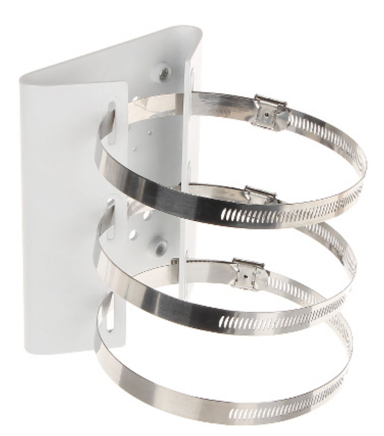
Top view - clamping strips diameters range: