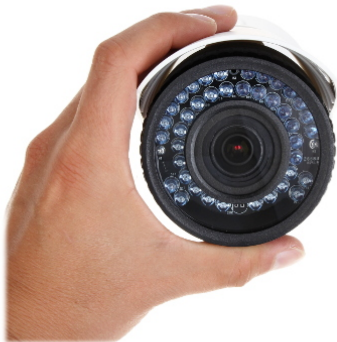
View after remove the cover: