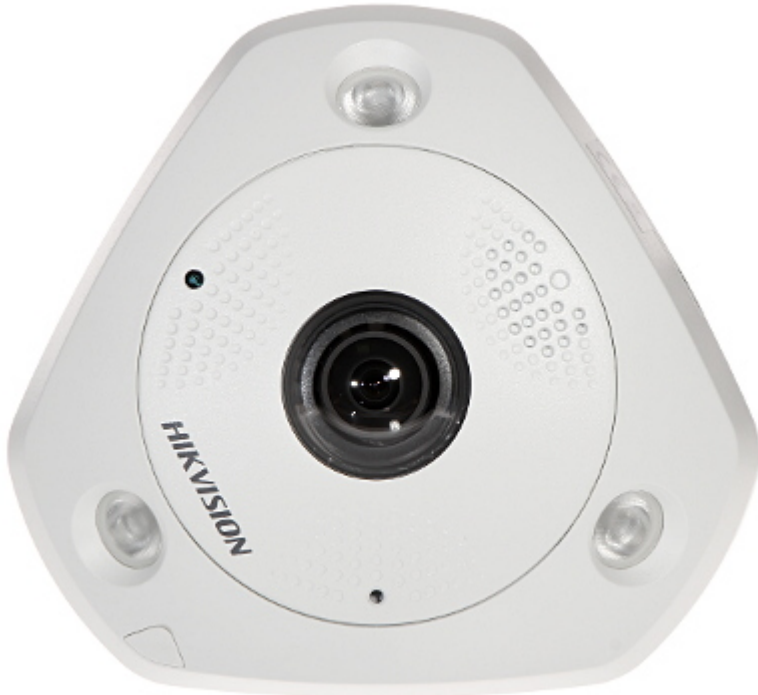
Camera view after remove the Dome cover: