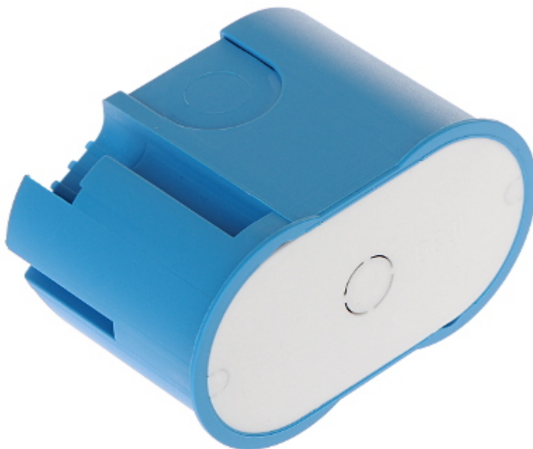
Flush mounting box. The box is made from non-halogen, self-extinguishing plastic.

The device must be secured against contact with caustic, staining and viscous fluids.