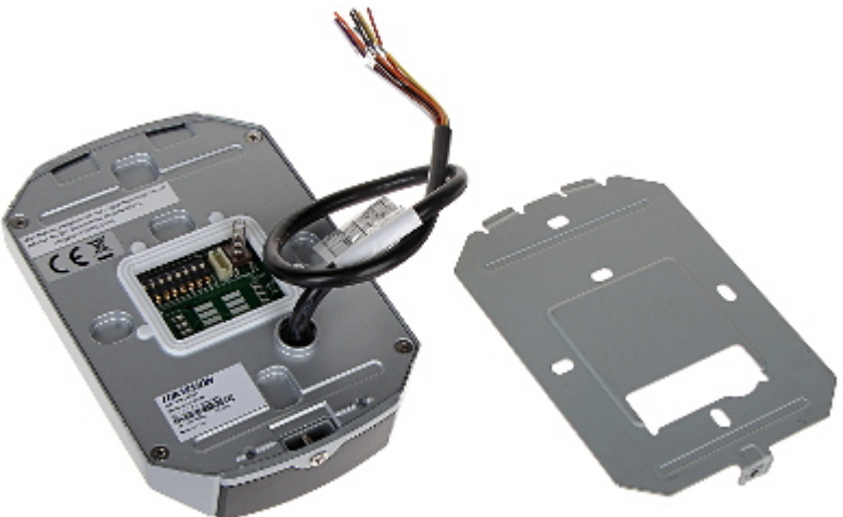
On the body, under the cover there are placed configuration switches: