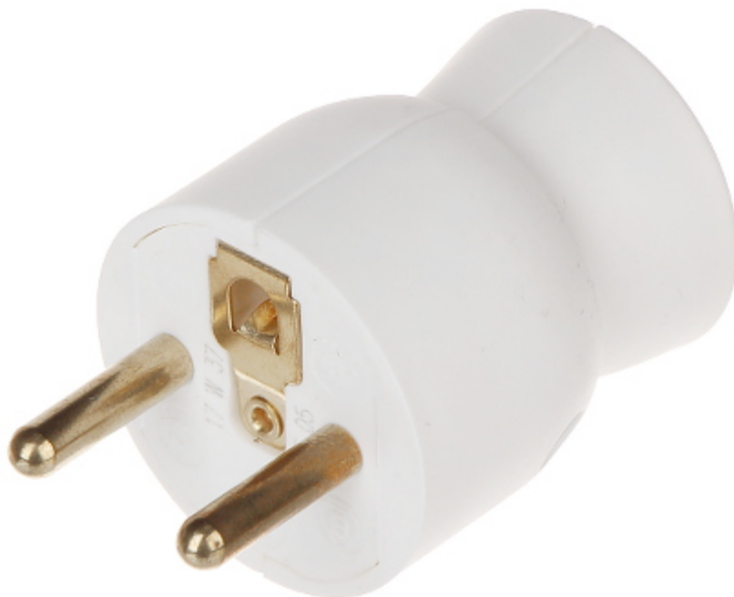
Plastic straight plug.