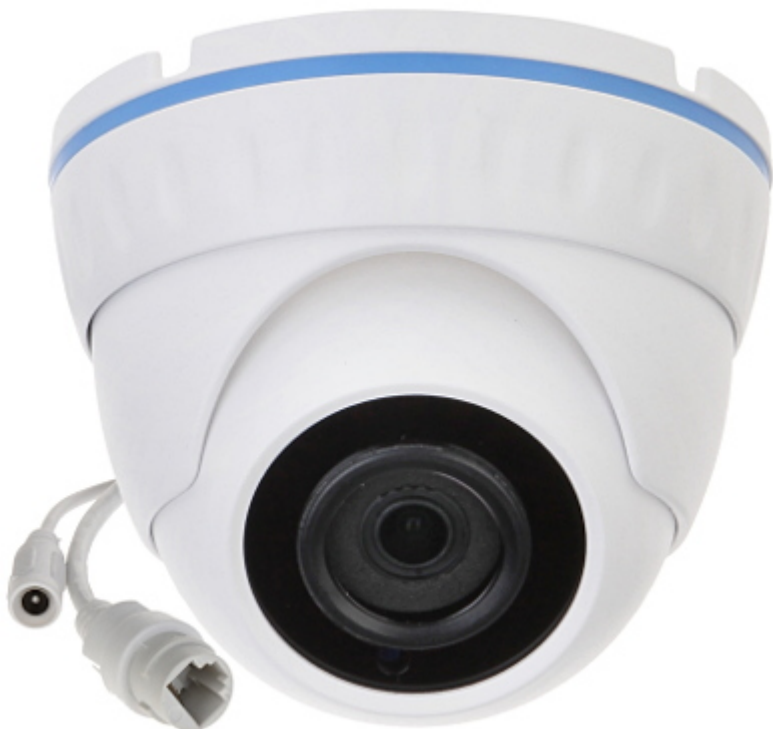
Camera is out from clamping ring: