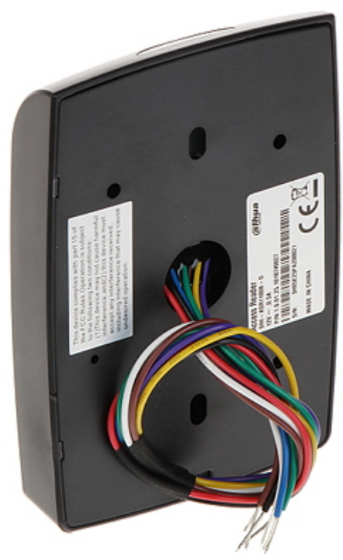
Internal view, after remove the cover:

Code: DHI-ASR1100B-D PROXIMITY READER DHI-ASR1100B-D DAHUA