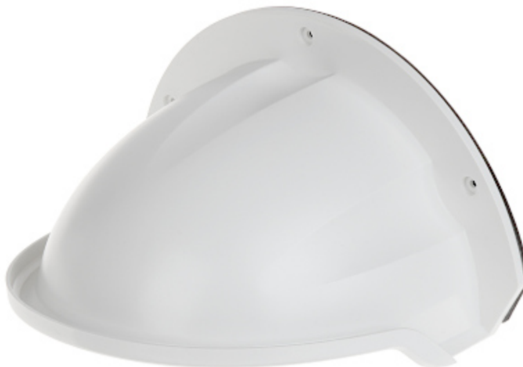
Rainproof housing for dome cameras.

The device must be secured against contact with caustic, staining and viscous fluids.