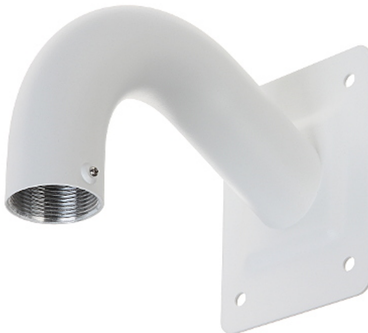
Wall bracket. Designed to PTZ Dahua cameras. It can be used to vandal-proof cameras installation.

The device must be secured against contact with caustic, staining and viscous fluids.