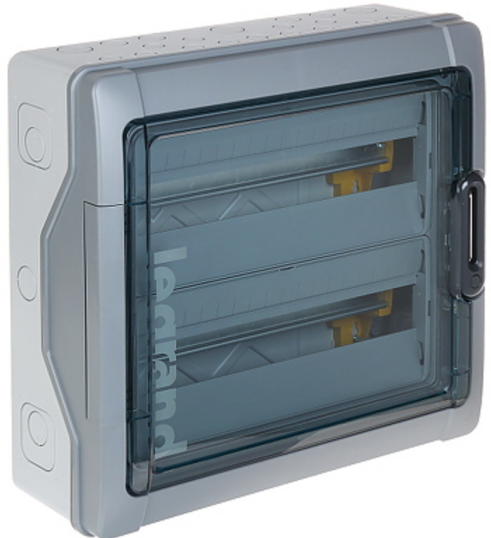
2-row 36-modular surface-mounting, hermetic distribution electric cabinet.

The device must be secured against contact with caustic, staining and viscous fluids.