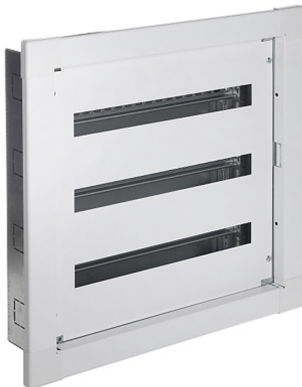
3-row 72-modular flush-mounting distribution electric cabinet.

The device must be secured against contact with caustic, staining and viscous fluids.