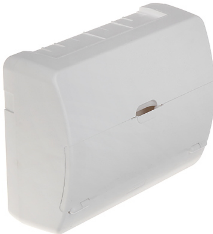
1-row 12-modular surface-mounting distribution electric cabinet.

The device must be secured against contact with caustic, staining and viscous fluids.