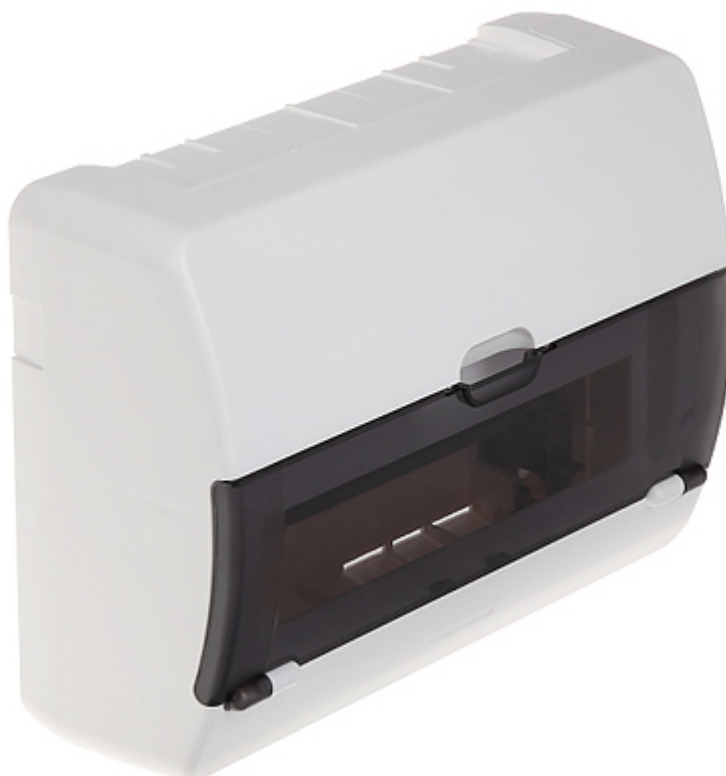
1-row 12-modular surface-mounting distribution electric cabinet.

The device must be secured against contact with caustic, staining and viscous fluids.