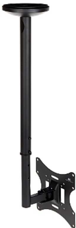
Monitor mounting side view: