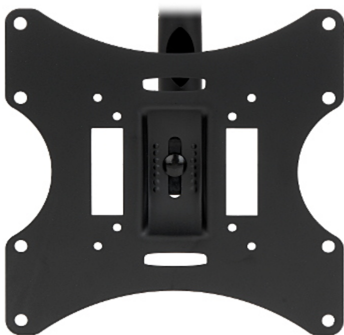
View of the ceiling mounting side: