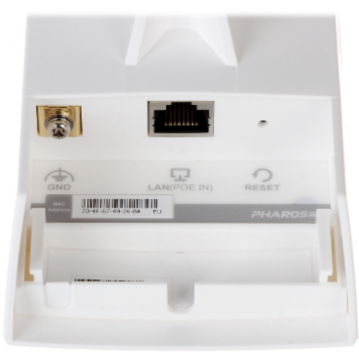
PoE Power Supply and Adapter:

Code: TL-CPE210 ACCESS POINT TL-CPE210 2.4 GHz TP-LINK