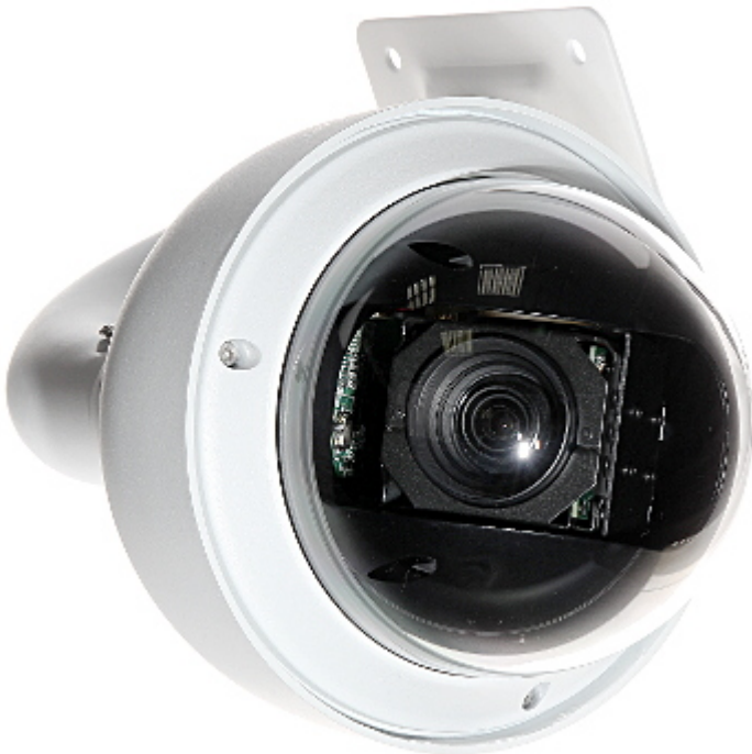
Bottom view (configuration switches visible):