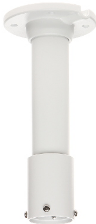
Ceiling bracket for cameras. Bracket has cable entry.

The device must be secured against contact with caustic, staining and viscous fluids.