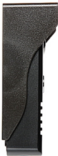
Monitor mounting side view: