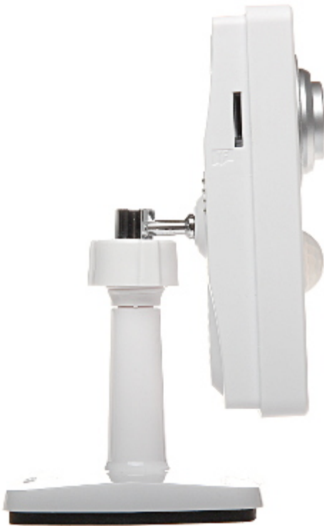
Camera mounting dimensions: