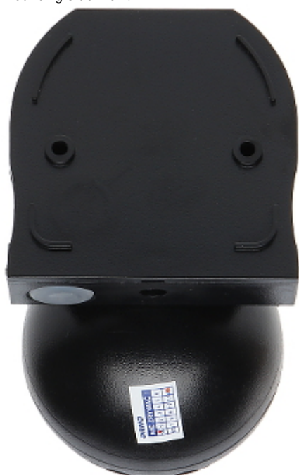
Rear view after remove the cover (cube power block connector visible):