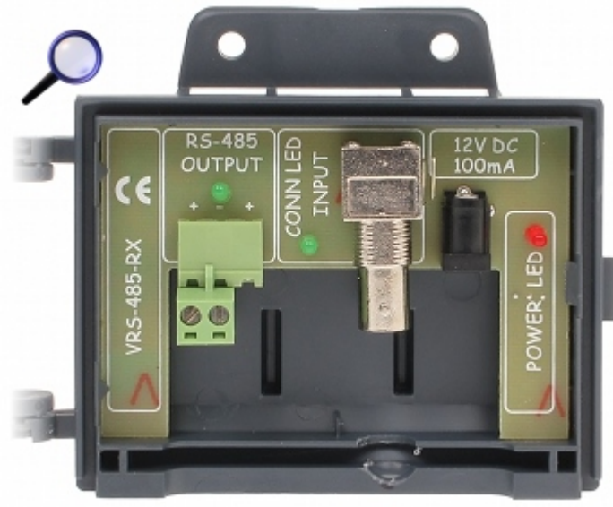
Application of particular elements of the receiver: