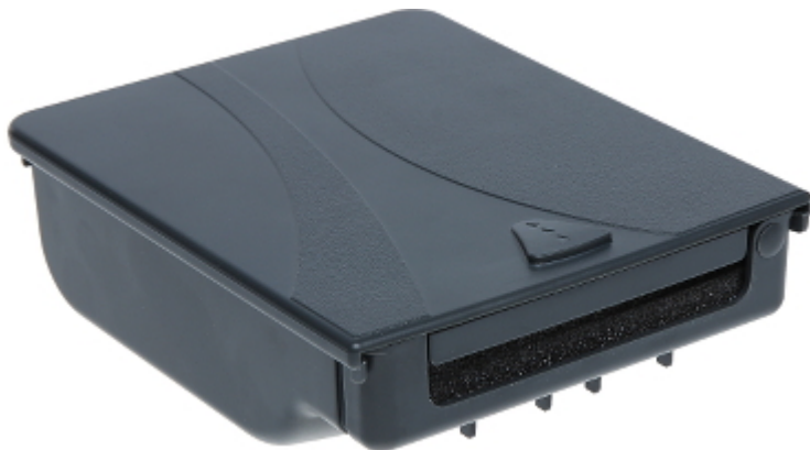
Destacker (mounted near by receiver):