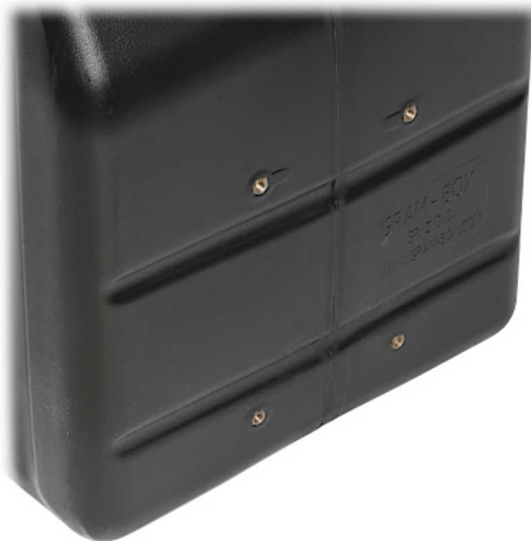
Water filling hole: