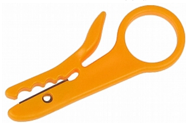
Insulation stripper for cables: UTP, YTKSY