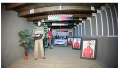
Camera image at artificial illumination (about 30Lux):