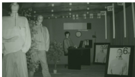
Camera image at direct strong light opposite to camera: