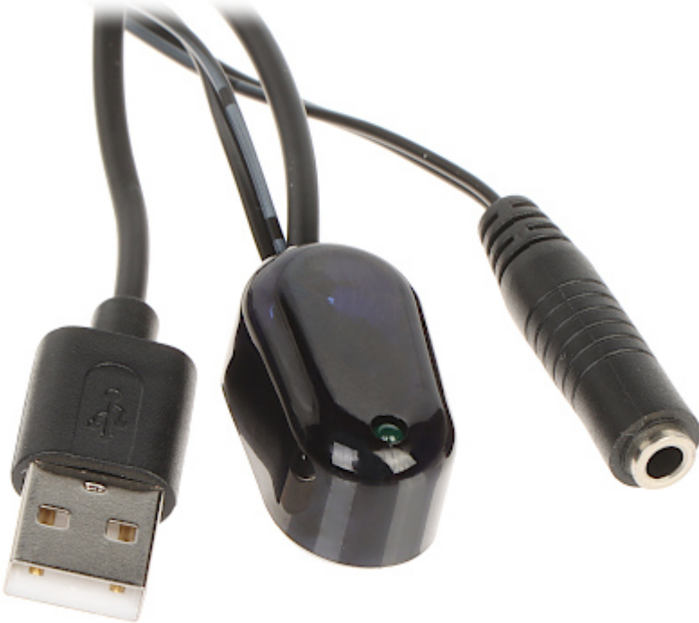
Typical operation diagram: