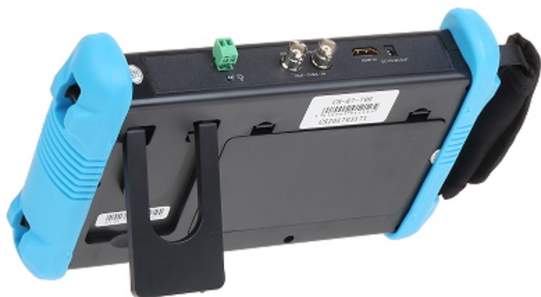
Battery view after open the cover: