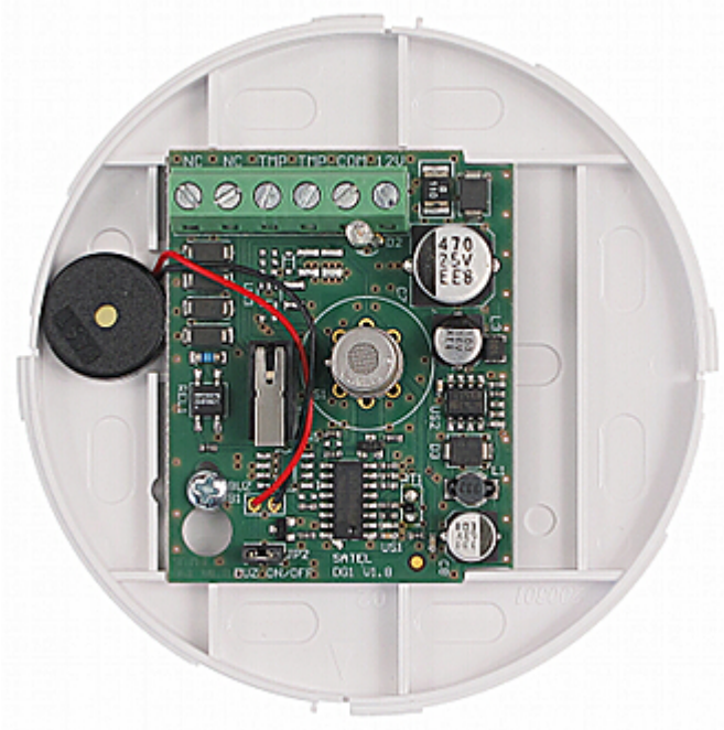
Rear view + additional kit elements: