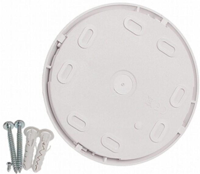
Description of particular elements of the device: