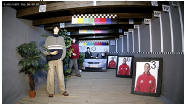
Camera image at artificial illumination (about 30Lux):