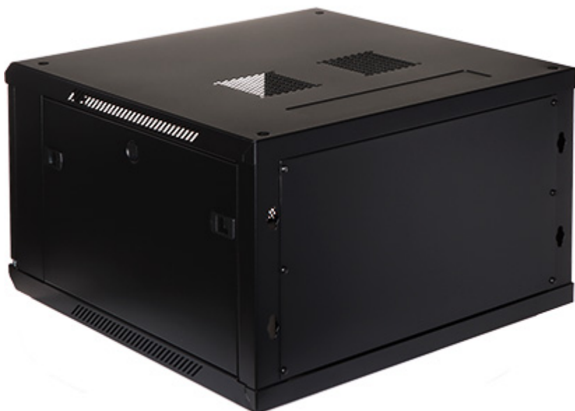
Cable entry in the floor: