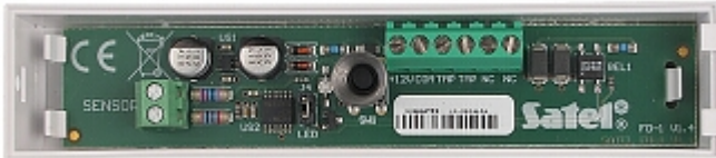
Rear view + additional kit elements: