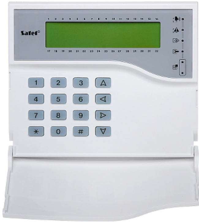
View after remove the cover: