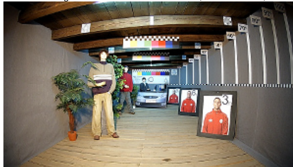
Camera image at night conditions with external IR illuminator on: