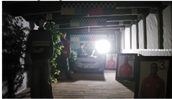
Camera image at night conditions, at different illumination values show below: