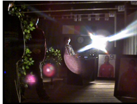
Camera image at night conditions, at different illumination values show below: